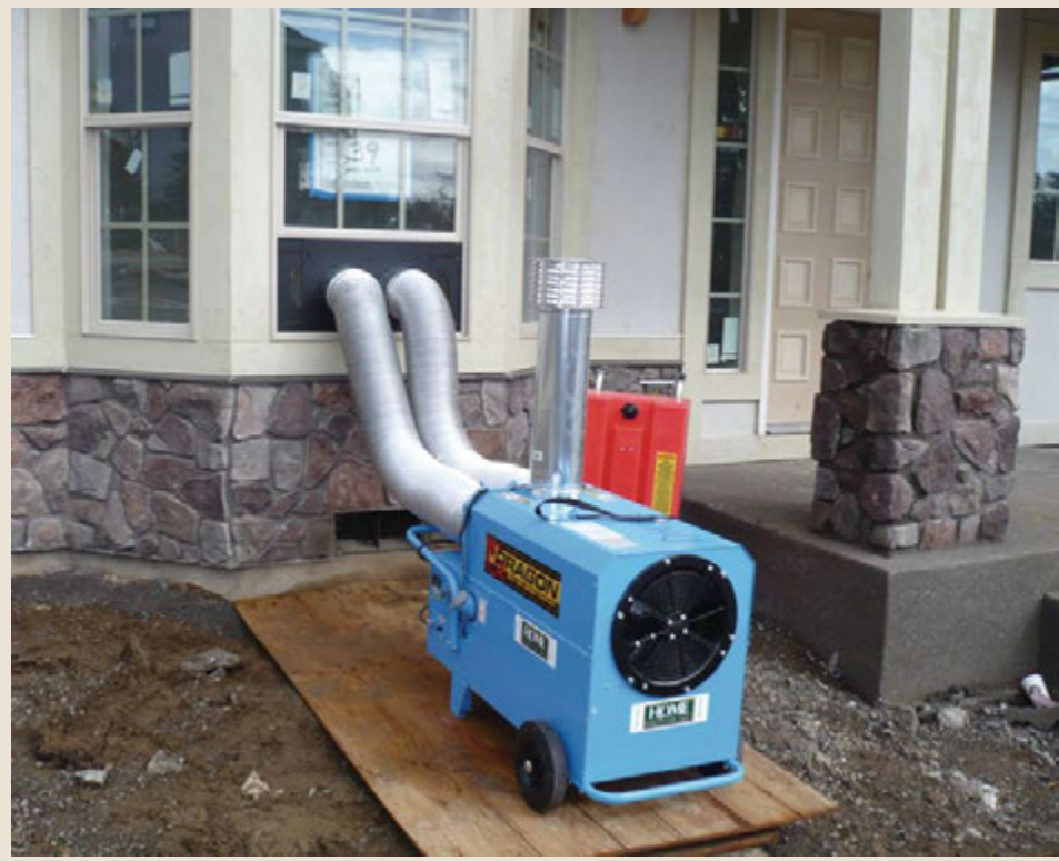
Diesel powered temporary heat when HVAC is not available.

Existing homes, which are often times at risk due to drainage prob-