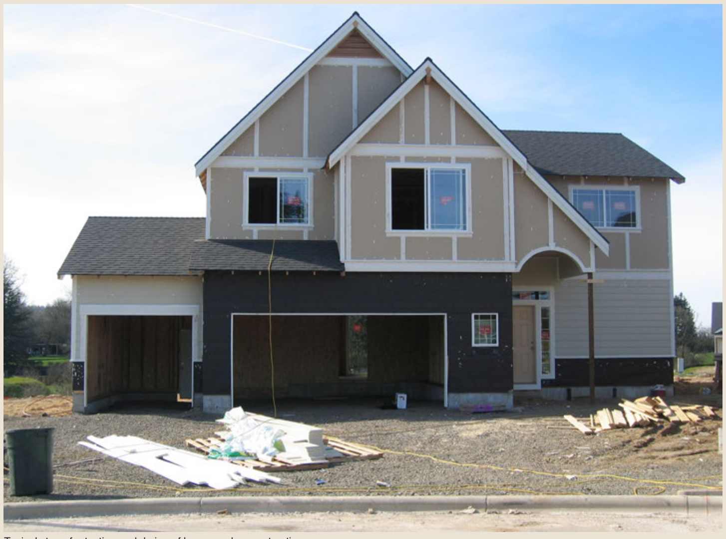
Typical stage for testing and drying of house under construction.