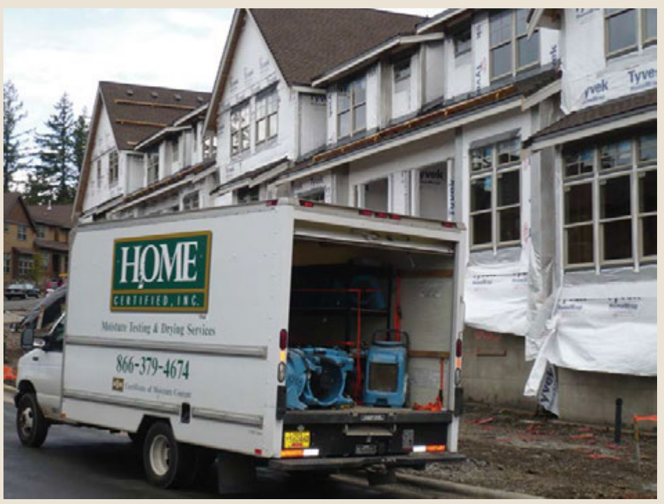
Delivery and set-up of drying equipment.

We have seen efficiencies in both time and expense.